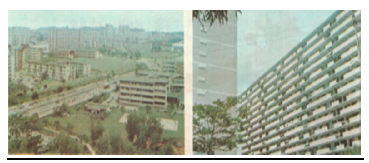
Figure 2: Low-cost flats represented in Cheng's (1973, p. 30) primary school geography textbook

The optimistic picture of progressively housing the nation is depicted through images of public housing and citing the rapid rates of completing these flats. Cheng's (1973, p. 29) Chinese geography textbook titled New Geography ('新地理') describes how low-cost flats built by the HDB is "a remarkable success" and has served to resettle people previously living in the densely populated parts of the city (see Figure 2). These low-cost flats "built by the Government" were sold to lowwage "Singapore citizens" (Nair et al., 1969, p. 20) through the long-term instalment plans in the "Home Ownership Scheme" (Cheng, 1973, p. 30). The public housing theme is represented as a landscape of nationhood where citizen's home ownership is bounded up with wages from employment and the CPF to pay for home instalment loans. As the public became ubiquitous housing synonymous with the HDB landscape, the imagined community of a "nation" is maintained and reproduced through the material landscape as well as the representations in school geography textbooks.