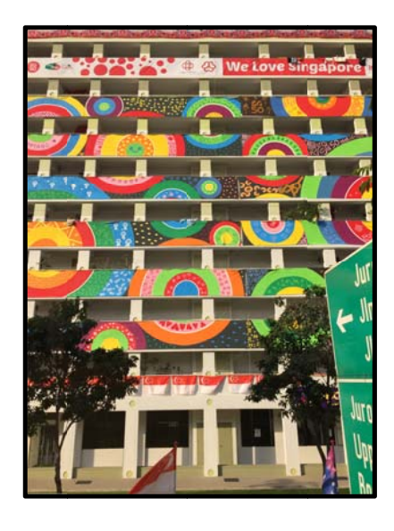
Figure 1: Singapore's public housing: Celebrating 50 years of building modern Singapore